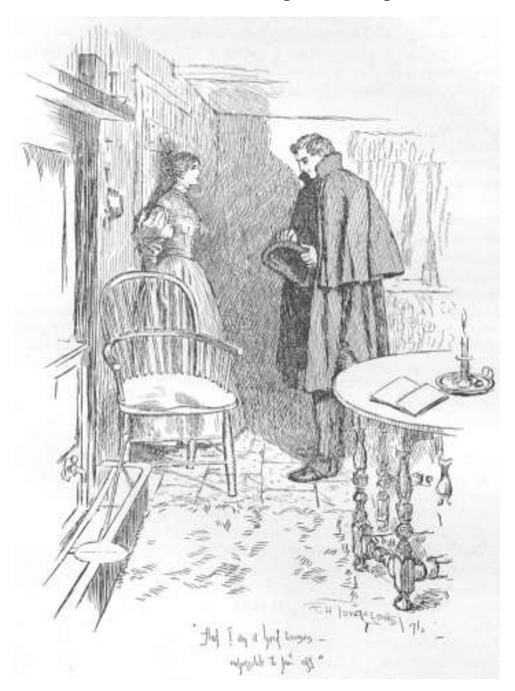
"And then," he pursued, "I am cold: no fervour infects me."