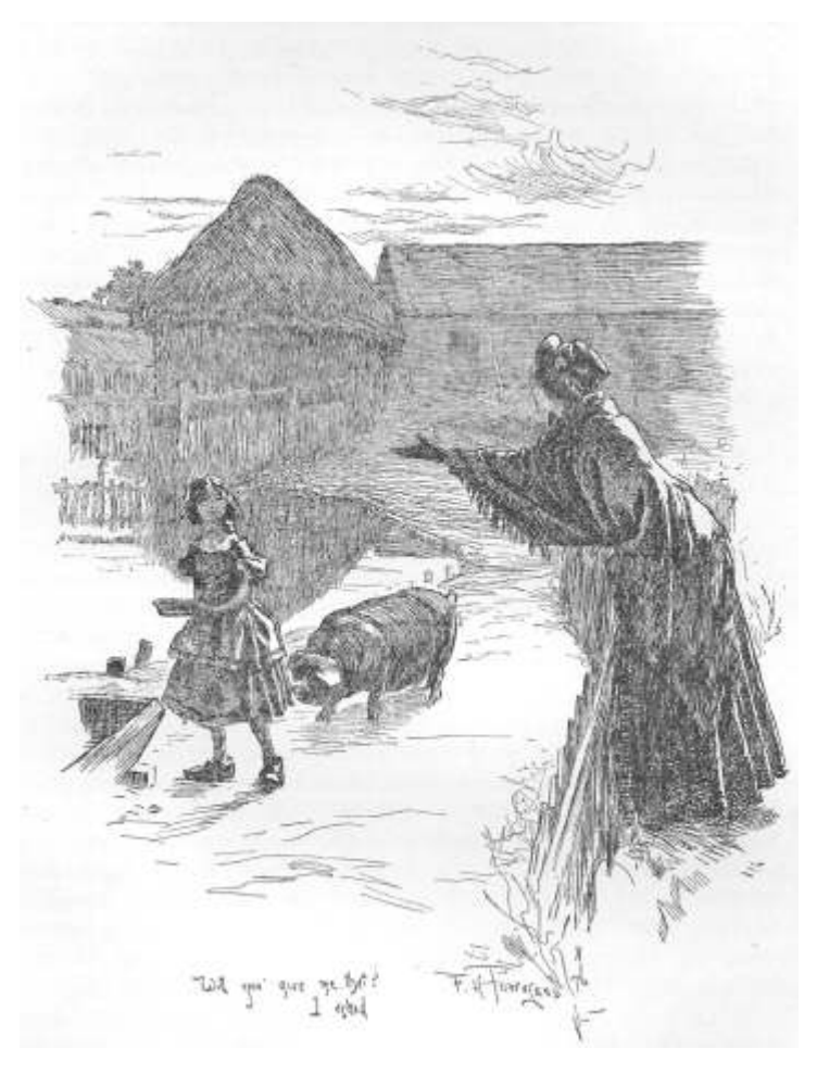
"Well lass," replied a voice within, "give it her if she's a beggar. T' pig doesn't want it."

The girl emptied the stiffened mould into my hand, and I devoured it ravenously.