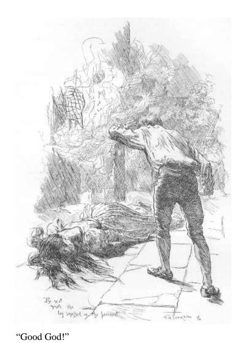
"You may well say so, ma'am: it was frightful!" He shuddered.