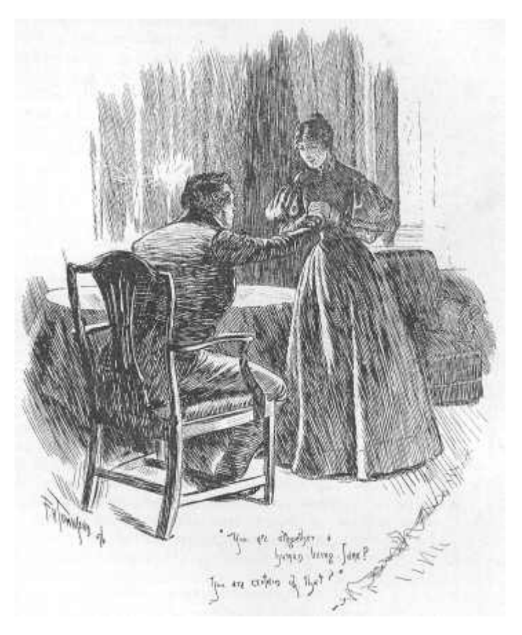
"Because I had come in, in Mary's stead, with the tray."

"And there is enchantment in the very hour I am now spending with you. Who can tell what a dark, dreary, hopeless life I have dragged on for months past? Doing nothing, expecting nothing; merging night in day; feeling but the sensation of cold when I let the fire go out, of hunger when I forgot to eat: and then a ceaseless