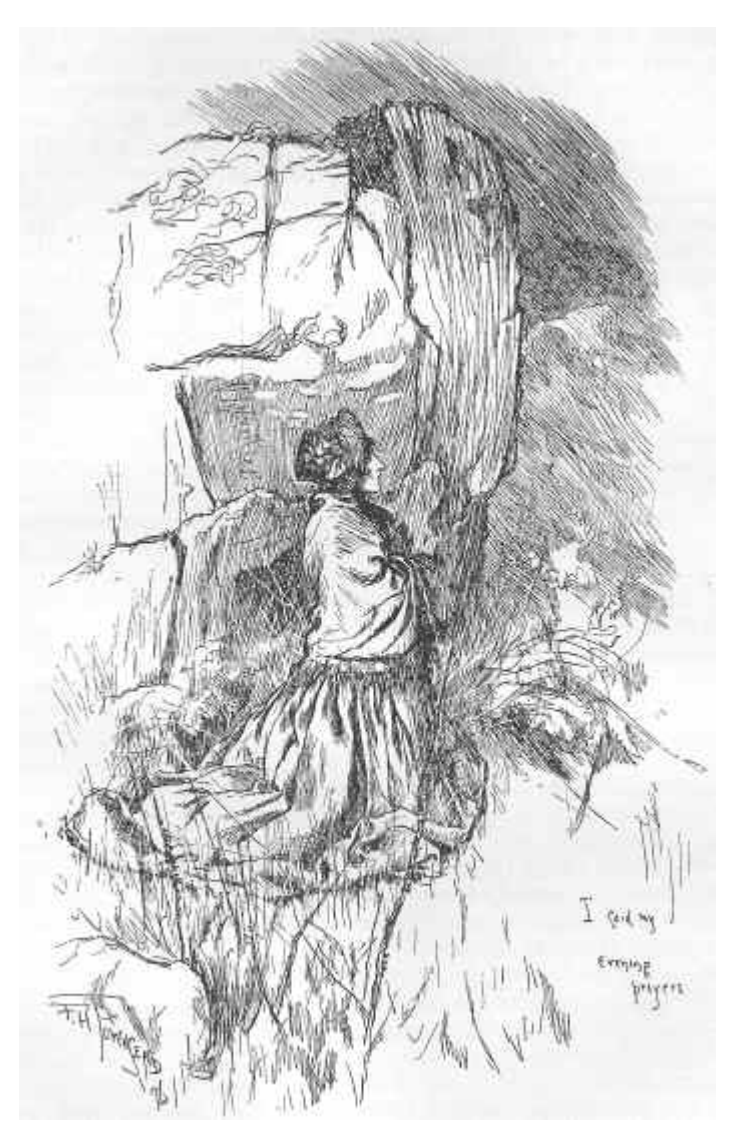
My rest might have been blissful enough, only a sad heart broke it. It plained of its gaping wounds, its